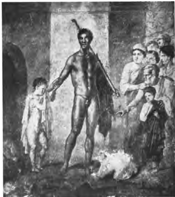
Fig. 80. Theseus and the rescued Athenians.

up his absolute royal power, and after uniting in one state all the divisions of Attica, he made of it a free self-governing commonwealth. After this he started out again on a career of adven-